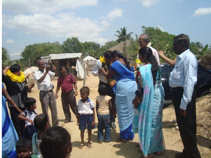
Kanthan Pre-School Opening Ceremony on 29-08/13