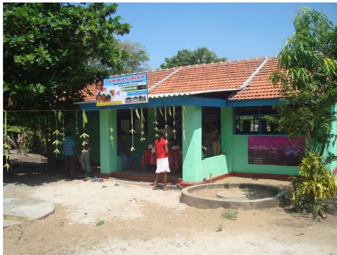
Vannan Pre-school after repair/renovation