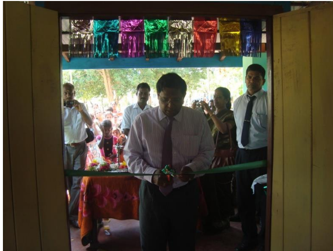
Vannan Pre-School Opening Ceremony on 29-08/13