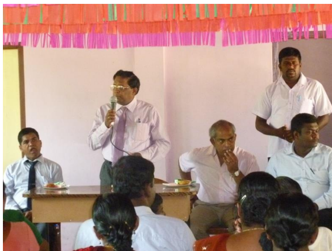
Subramaniyam Pre-School Opening Ceremony on 29-08/13