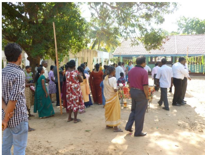
Subramaniam Pre-School Opening Ceremony on 29-08/13