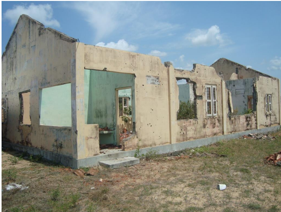
Chandran Pre-School in Mullivaikal East before Rebuild/Renovation

AssistRR considered this school as the top priority and completed the renovation of this school in June 2013. Chandran Pre-School in Mullivaikal was declared open by Mullaithivu GA on 10 June 2013. AssistRR also built two toilets for the benefit of the local villagers within the school boundary in addition to the school toilet inside the school building.