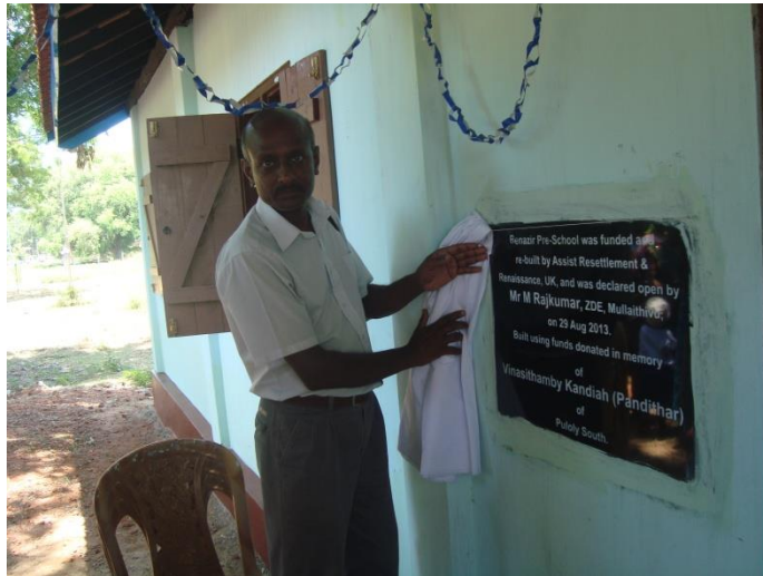
Benazir Pre-School Opening Ceremony on 29-08/13