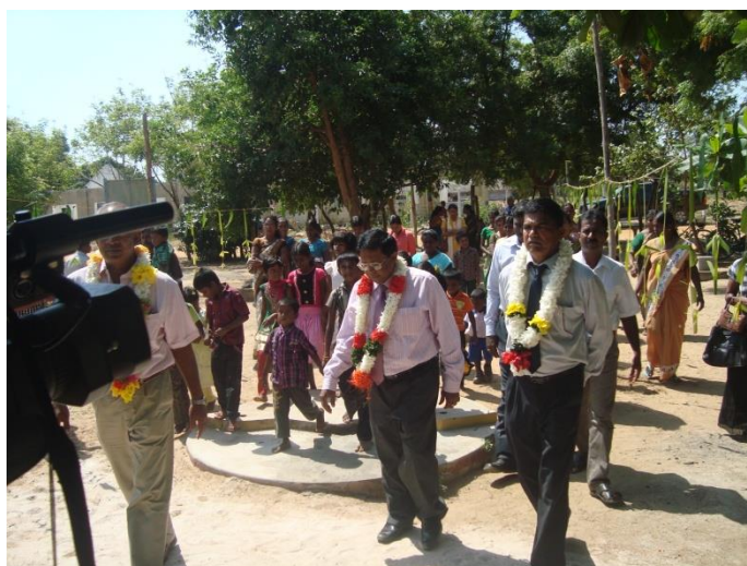
Vannan Pre-School Opening Ceremony on 29-08/13