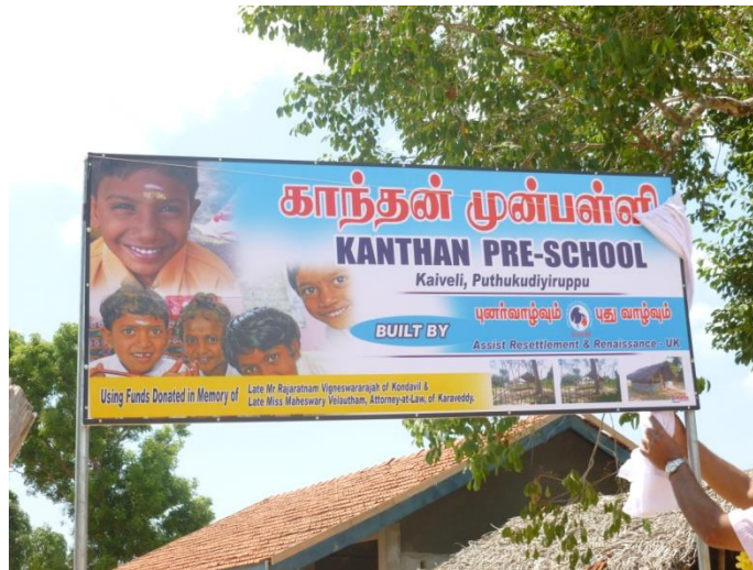
Kanthan Pre-School Opening Ceremony on 29-08/13