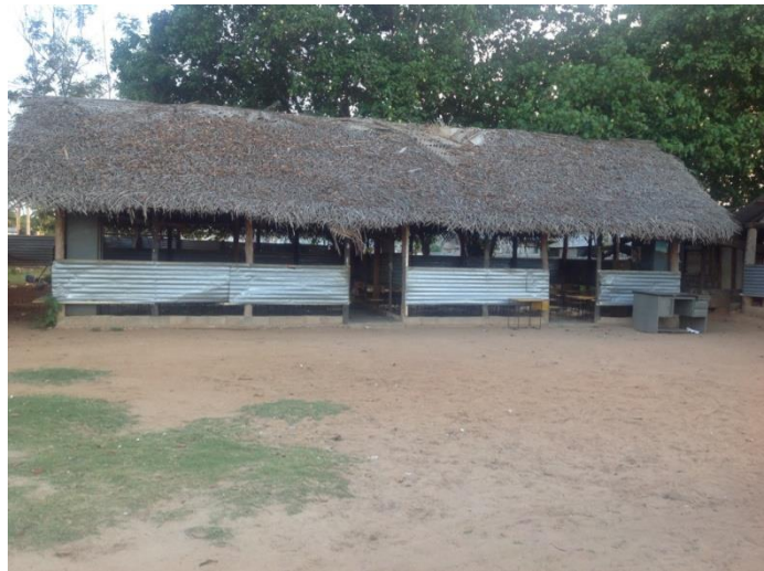
Temporary shelters of Subramaniya Vidyasalai in need of permanent buildings

We hope you will appreciate the progress AssistRR has made within a short space of time and that you will continue to support future projects including the repair of the above three schools. Your contributions would be very much cherished by us as well as by the war affected people in Vanni.