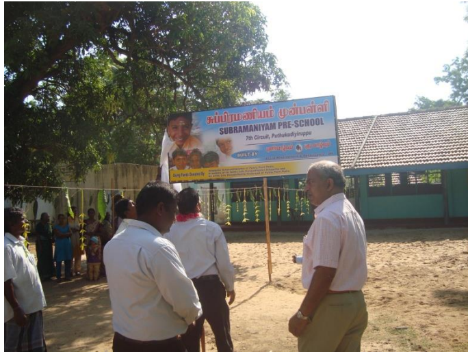
Subramaniyam Pre-School Opening Ceremony on 29-08/13