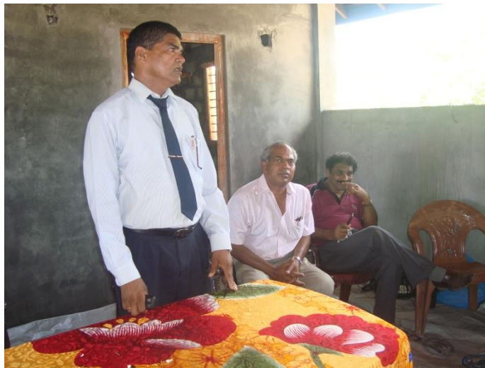
Kanthan Pre-School Opening Ceremony on 29-08/13