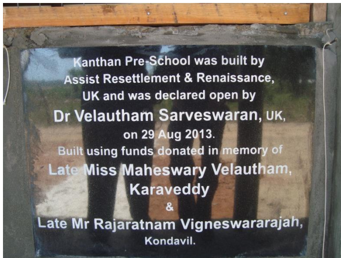
Kanthan Pre-School Opening Ceremony on 29-08/13