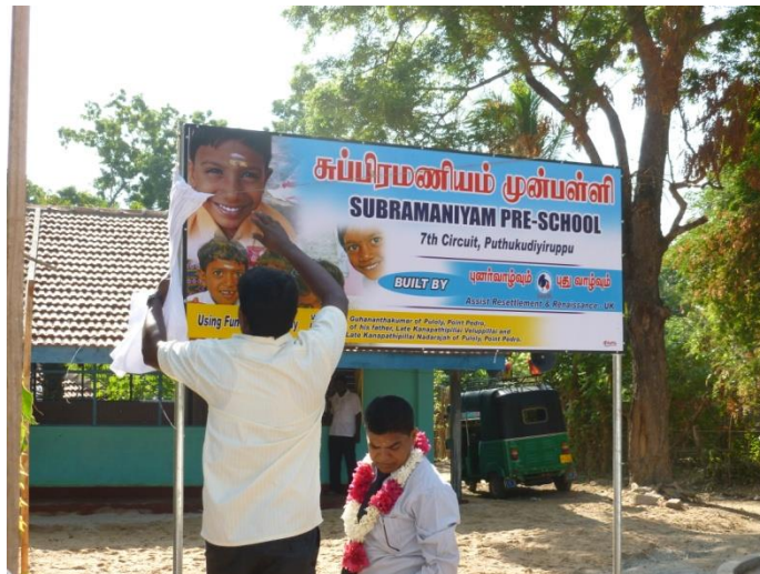
Subramaniam Pre-School Opening Ceremony on 29-08/13