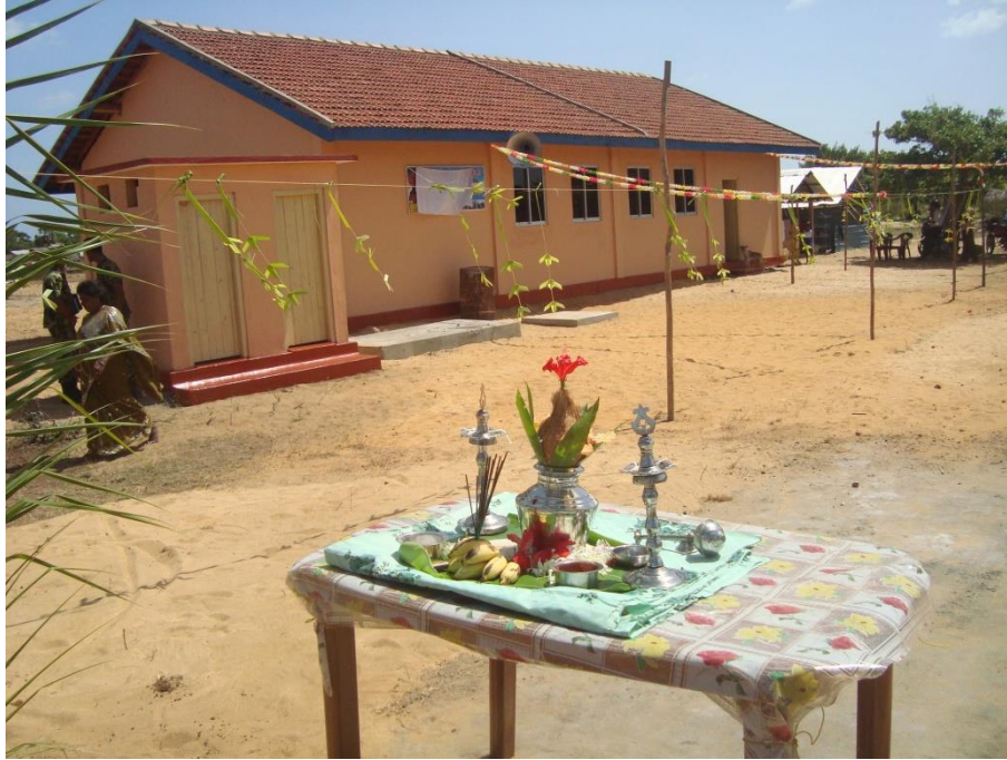
Chandran Pre-School in Mullivaikal East after Rebuild/Renovation in June 2013

Following the successful completion of Chandran pre-school in Mullivaikal, AssistRR made appeals for donations for the pre-school project and received donations from a number of individuals for building and renovating more pre-schools. Using these funds, AssistRR managed to build two more new pre-schools and repair/renovate another two pre-schools in Mullaithivu district. These pre-schools, which were completed in August 2013 and declared open on 29 August 2013, are as follows: