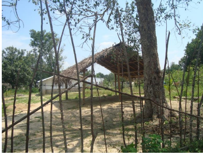
Kanthan Pre-School before construction