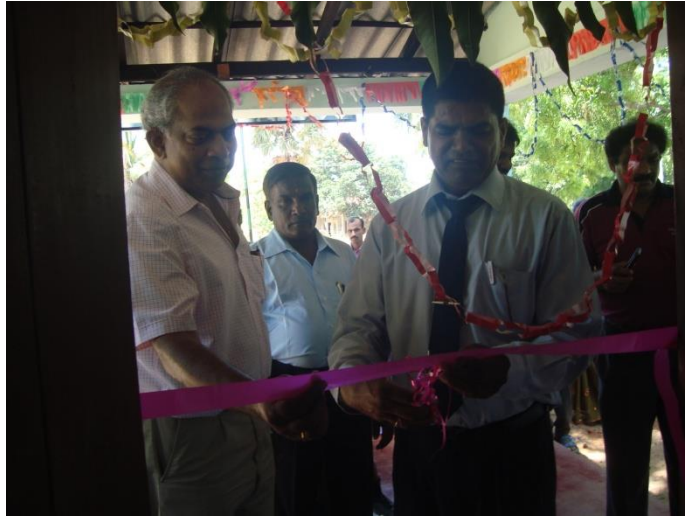
Benazir Pre-School Opening Ceremony on 29-08/13