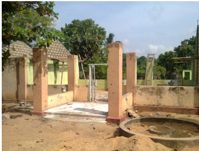
Vannan Pre-school before repair/renovation