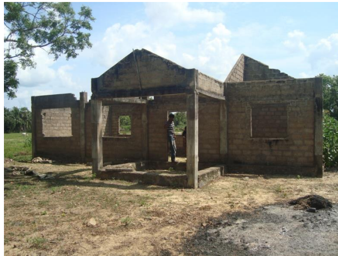
Benazir Pre-School before repair/renovation