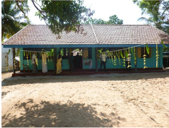
Subramaniam Pre-School Opening Ceremony on 29-08/13