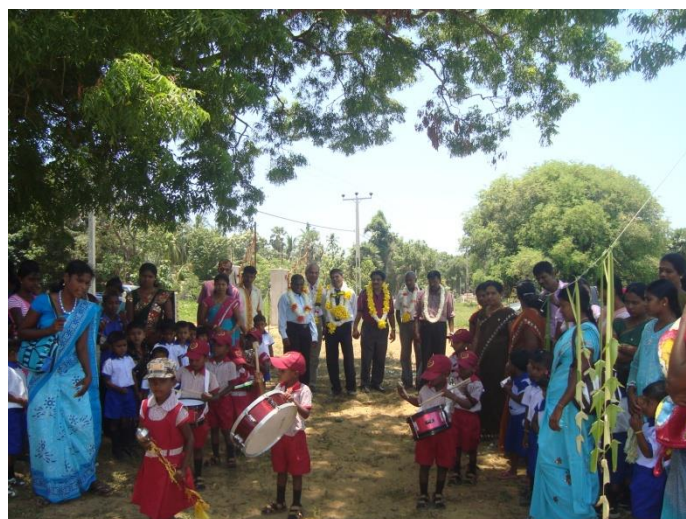
Benazir Pre-School Opening Ceremony on 29-08/13