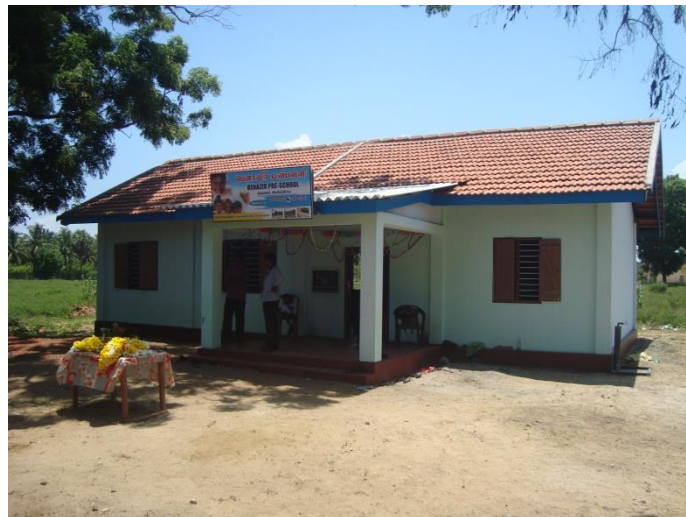
Benazir Pre-School after repair/renovation