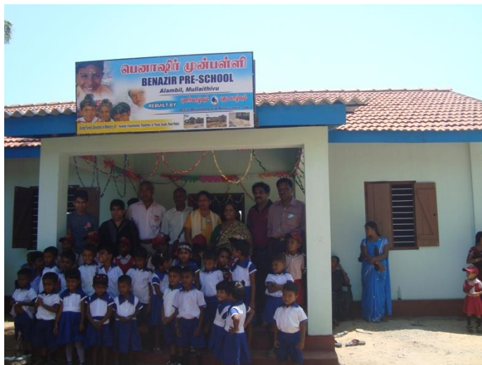
Benazir Pre-School Opening Ceremony on 29-08/13