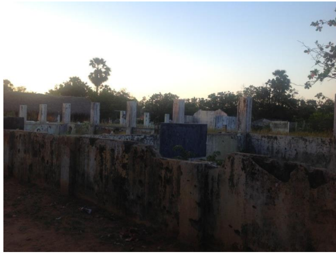
Damaged Buildings of Subramaniya Vidyasalai, PTK