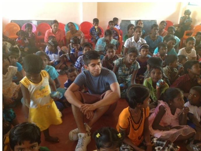
Vannan Pre-School Opening Ceremony on 29-08/13