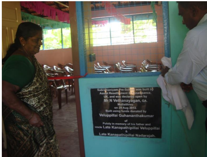
Subramaniyam Pre-School Opening Ceremony on 29-08/13