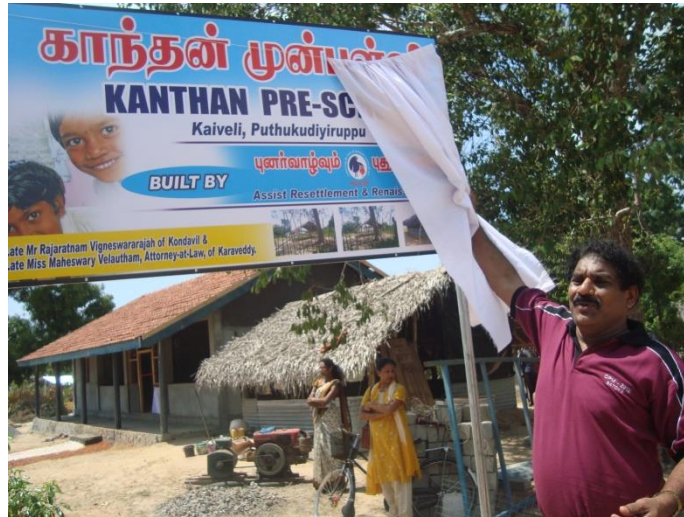
Kanthan Pre-School Opening Ceremony on 29-08/13