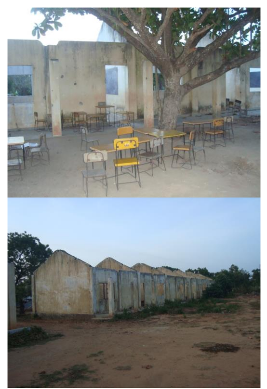
Veenavil Govt Tamil Mixed School

When he met the Director of Education, Mullaithivu, he made a request to repair/renovate a primary school building, which has no roof. The school is Veenavil Govt Tamil Mixed School. In this school, there is only one temporary building and in my opinion, it desperately needs someone's assistance. Chairman agreed in principle and asked for an estimate of the cost. We will decide based on the costs estimate. However, we recommend that we help this school.